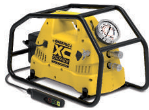
XC-Series Battery Torque Wrench Pumps