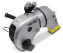
DSX-Series Torque Wrenches