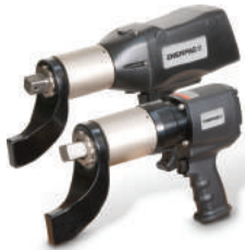
ETW & PTW-Series Torque Wrenches