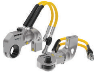
RSL-Series Torque Wrenches