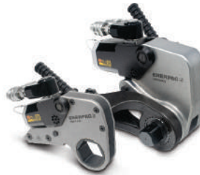
HMT-Series Torque Wrenches