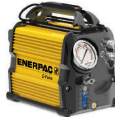
E-Pulse Pumps Torque Wrench Pumps