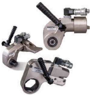
S & W-Series Torque Wrenches