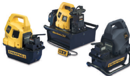
Z-Class Torque Wrench Pumps