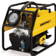
TQ700-Series Torque Wrench Pumps